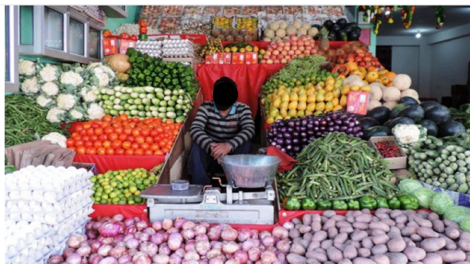
Fig. 1. Full-Service Retailer – 1

The findings of this research reported that aesthetics of retail stores differed based on their layout. The layout of the full-service and self-service was different. In case of self-service layout, since customers of self-service retail outlets have to move around in the retail, considerable walking space was provided. This was not the case in case of full-service retailers. In case of full-service retailers, walking or moving space was kept only for the retailer. This can be seen in figure 1, 2, 3 and 4, which are given below.