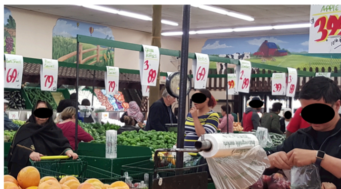
Fig. 4. Self-Service Retailer - 2

Figure 5 given below gives a picture of a website which offers vegetables online.