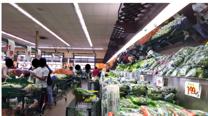
Fig. 3. Self-Service Retailer - 1