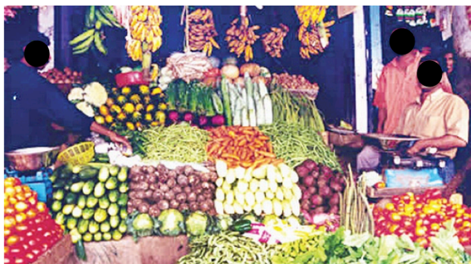
Fig. 2. Full-Service Retailer - 2