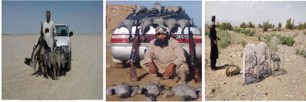
Fig. 1. Certain human activities i. e. shooting, hunting and trapping of Crane and Houbara Bustard

greater numbers (1,200 in 2021 and 2,500 in 2022) compared to common Cranes (95 in 2021, 102 in 2022), suggesting the latter's alarming scarcity due to overhunting as shown in Fig 2.