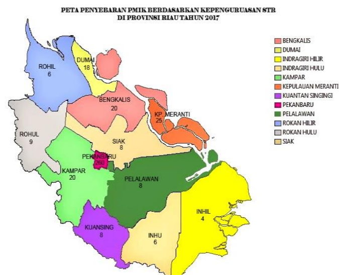
Figure 4. The Distribution of Medical Record and Health Information Professional Based on STR Management in Riau Province in 2017

Based on the thematic map of figure 4, the information of the distribution of Medical Record and Health Information Professional based on STR Management in Riau Province, Pekanbaru has the highest distribution in terms of STR management which are 260 people marked with pink symbol. It is followed by Meranti Island District with 25 people, 20 people from Bengkalis and 20 people from Kampar. For the lowest distribution in STR management, there are 4 people in Indra Giri Hilir District.