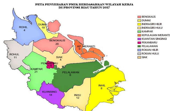
Figure 1. Map of The distribution of PMIK based on the Work Area in Riau Province in 2017

a. The distribution of medical record and health information professional (PMIK) with thematic map in the districts/ cities of Riau Province